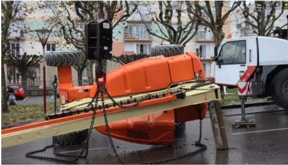
Halfway up and blocked for re-rigging

A three axle All Terrain crane was called in to recover the lift and proceeded to put the lift back on its wheels. The recovery was filmed and the video spotted by one of our readers who sent it in, alerting us to the incident. If anyone has any further details we would be pleased to hear from you. To watch the video yourself simply click here .