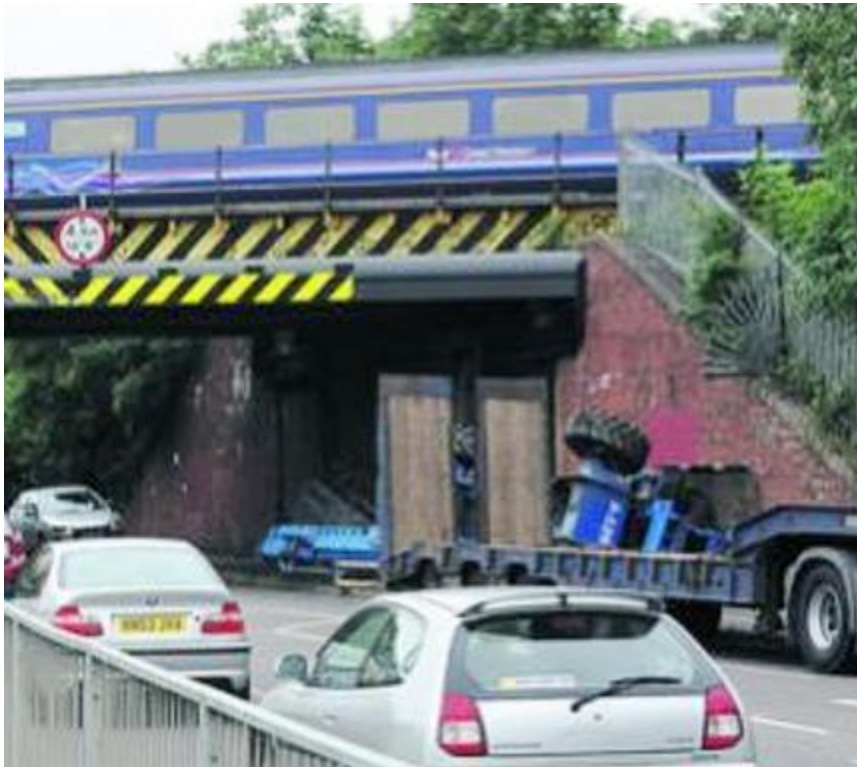
The scene yesterday

No one was hurt in the incident and damage appeared to be limited to the boom lift, there was however considerable disruption to traffic while the unit was recovered from the scene.