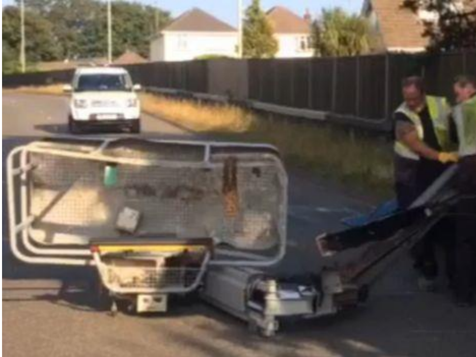
The boom section, jib and platform are recovered under the eye of a police car

http://www.vertikal.net/en/news/story/20759/