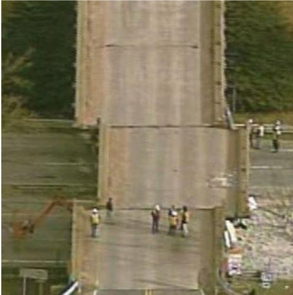
The bridge deck was moved over 1.5 metres

The incident occurred last Monday near Spartanburg when a JLG Ultra Boom, owned by Ahern Rentals and transported by a private contractor, passed underneath the bridge at speed, ripping the lift off the trailer and moving the deck.