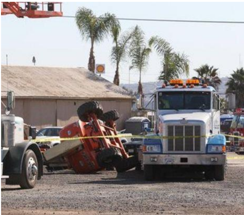
The boom slipped off the side of the low loader

The incident occurred in the Palm City area of the city, the man who would have been 59 on Saturday landed on his head when the machine went over, we do not know if he was thrown from the platform or managed to hit his head from within the basket.