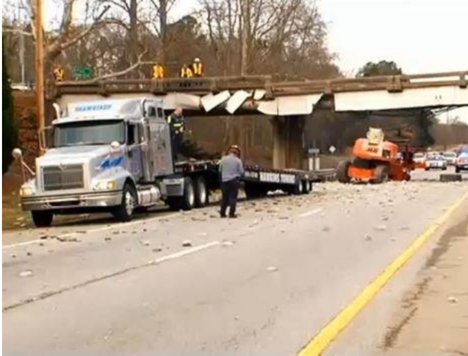
The truck looks as though it was from a third party hauler http://www.vertikal.net/en/news/story/19237/