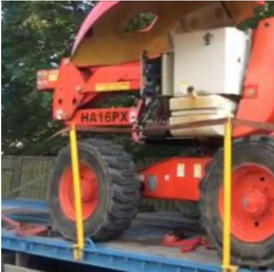
The machine remained firmly on board

We understand that the boom section, jib and basket after striking the road remained attached to the machine via its hydraulic hoses and cables. The truck pulled up and help was called to load the section back onto the truck. Meanwhile the road was closed while the bridge was checked and the road surface patched. Thankfully no one was injured.