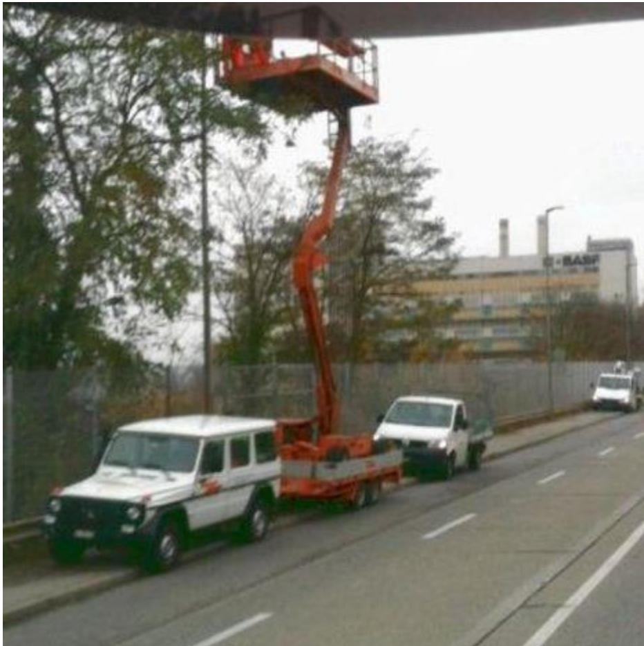
The Speed Level trailer lift

However when the user got to the run of trees he needed to work on he simply pulled his four by four and trailer up onto the kerb, started the lift and rather than unload it, proceeded to use it from the back of the trailer.