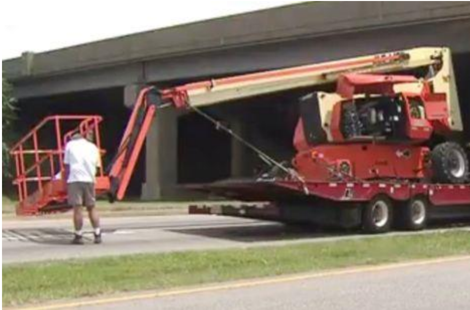
At least one of the wheels broke off http://www.vertical.net/en/news/story/20536/