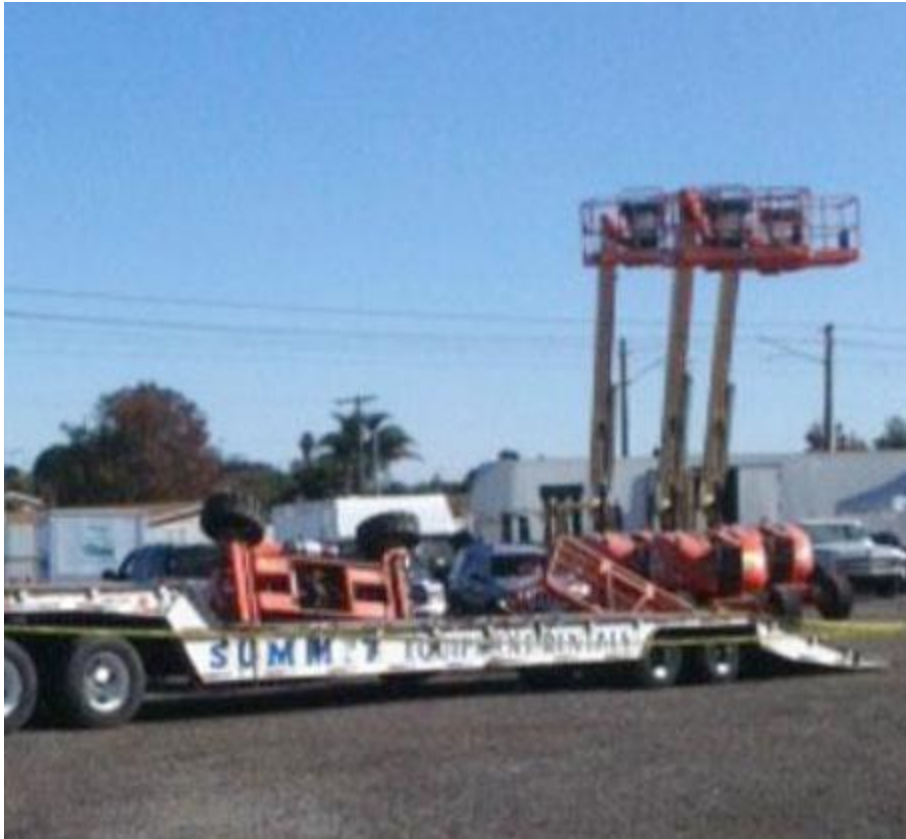
The trailer was relatively low and was outside the rental yard