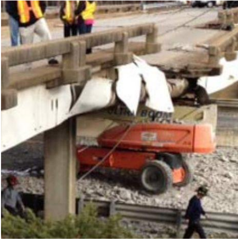
The bridge was damaged beyond repair

The bridge section has now been removed and the Interstate reopened. Police said that the driver of the tractor-trailer has been charged with discharging his load on the highway.