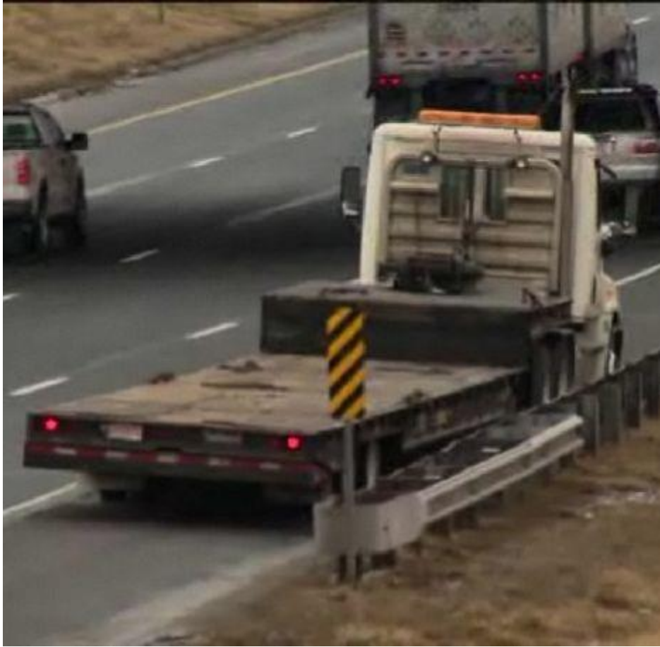
The delivery truck

http://www.vertikal.net/en/news/story/16908/