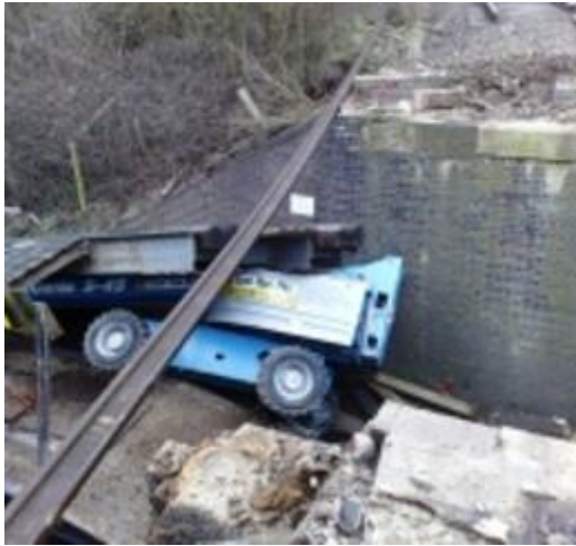
The boom appears to have been stowed correctly

Easi-Uplifts says that it is unable to comment apart from confirming that the accident occurred, that the machine was correctly stowed on the trailer and that the driver had passed underneath the bridge, which is close by the company's midlands depot, on many occasions before with no problem.