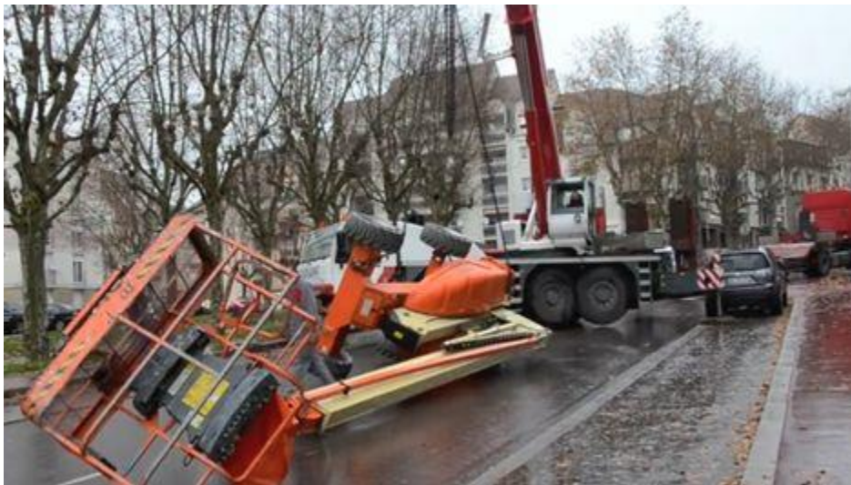
The overturned lift - note the delivery vehicle in the background

A man was injured when a boom lift overturned in Le Creusot, France on November 21st, quite how we are not completely sure and so far have been unable to confirm any details.