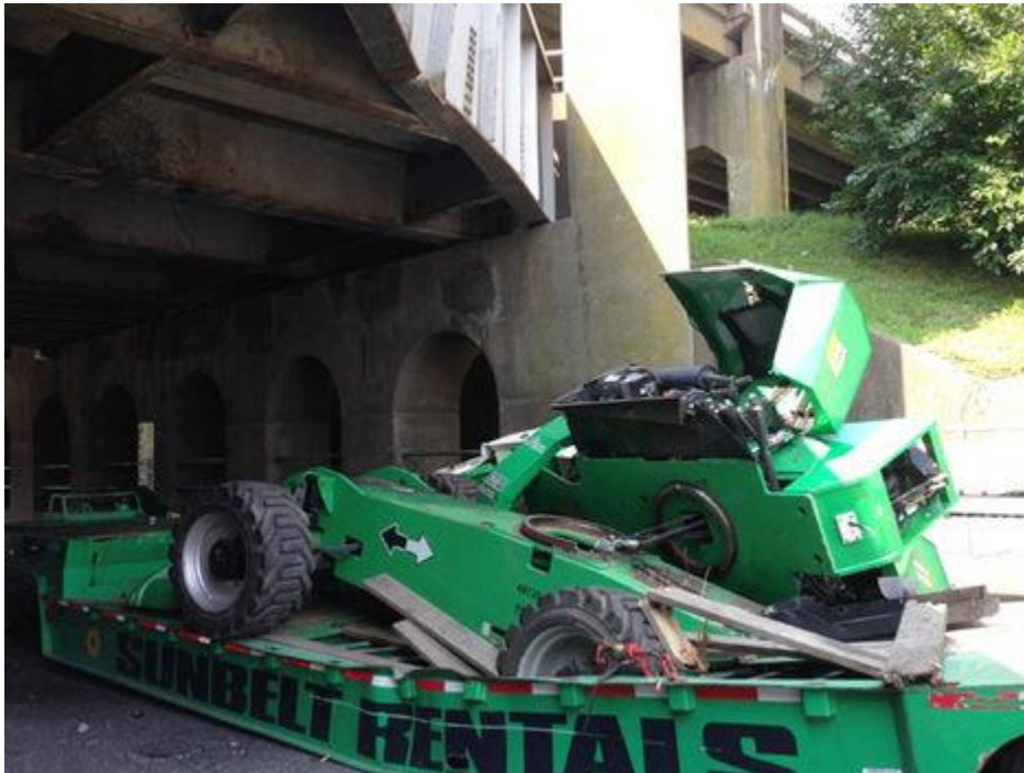
The superstructure is ripped off

The unit a relatively new JLG is owned by Sunbelt Rentals as is the delivery rig, the driver suffered from minor injuries in the incident. The bridge was damaged and the road was closed for some time while a large oil spill was cleaned up and the truck removed.