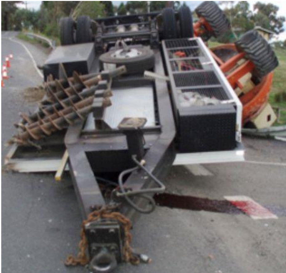
The overturned trailer and boomlift

A 13 tonne trailer carrying a self-propelled boom lift overturned as the towing vehicle, reportedly a dump truck, took a corner too fast in the town of Plenty, Victoria – North East of Melbourne in Australia.