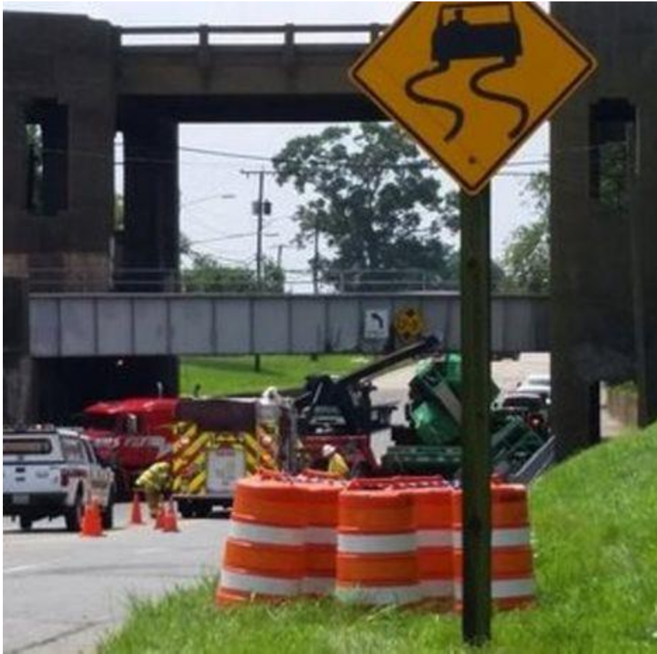
The lower bridge is supposed to have a clearance of almost 4.2 metres http://www.vertikal.net/en/news/story/20747/