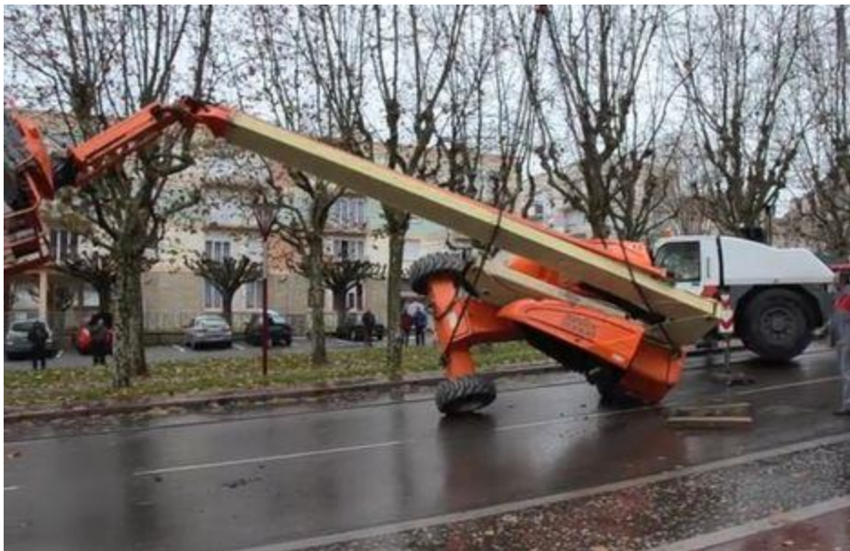
Up she comes

A three axle All Terrain crane was called in to recover the lift and proceeded to put the lift back on its wheels. The recovery was filmed and the video spotted by one of our readers who sent it in, alerting us to the incident. If anyone has any further details we would be pleased to hear from you. To watch the video yourself simply click here .