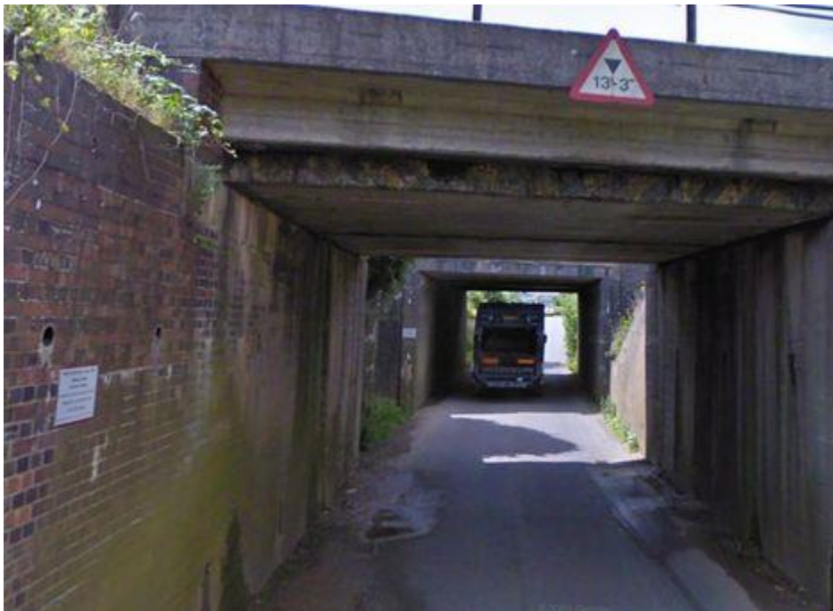
The Fenny Compton rail bridges prior to the accident

Locally there were suggestions that the bridge which came down had been subjected to earlier damage that might have reduced the clearance height.