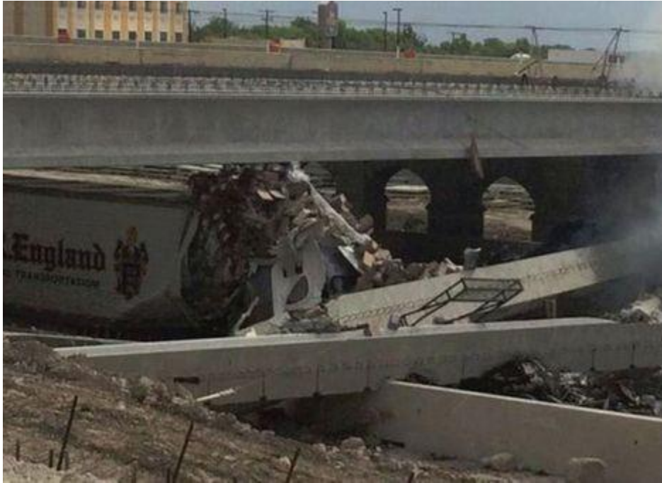
The next truck caught up in the damaged beam and pulled it down http://www.vertical.net/en/news/story/22461/